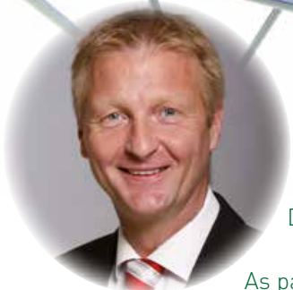
Ralf Jäger MP, Minister for Home Affairs and Local Government of the State of North Rhine Westphalia